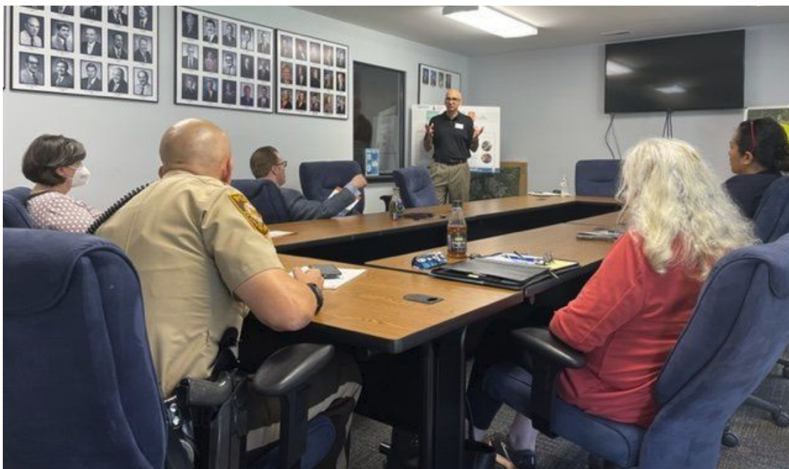
Pictured Above: North County Chamber

Since late April, the planning team for the Jamestown Mall Market Analysis and Feasibility Study has been conducting a series of small group conversations with subdivisions, neighborhood groups and other organizations throughout North County. These meetings were limited to 10 to 15 people to allow participants the opportunity to have a detailed conversation with members of the planning team. Participants were asked to share their thoughts and reactions to the initial six land use scenarios for the site. The initial scenarios were based on background data gathered through an analysis of census data, regional economic trends, and other information. It is important to note that these six land use scenarios are just the starting point in the process for analysis and evaluation.