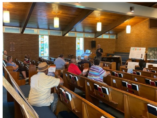
Pictured above: Old Jamestown Assoc. (May 10); Multiple Subdivisions (May 12)

To learn more about the initial six land use scenarios, visit the project website, imaginejamestownmall.com , where there is a section on the small group meetings and an overview video of the different scenarios can be found on the home page.